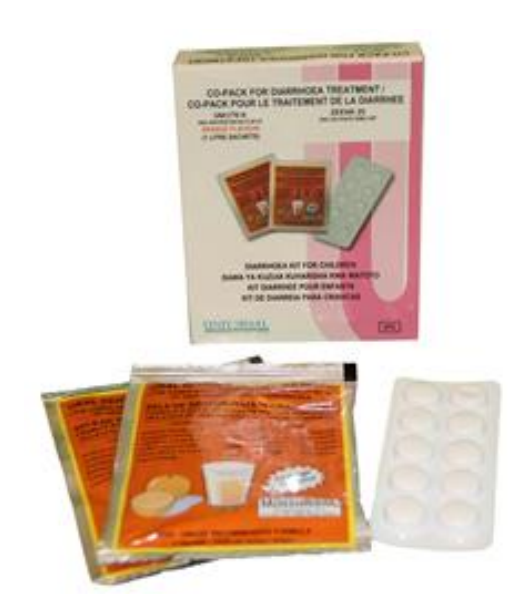
Figure 1 Co-Packed ORS and Zinc

In many countries, ORS is an over-the-counter medicine (OTC) while zinc is a prescription only medicine (POM). In order to ensure that OTC classification was retained for copackaged ORS and zinc, UNICEF together with the Pneumonia and Diarrhoea Working Group of the UN Commission advocated for zinc reclassification from POM to OTC. Many countries have implemented the switch, enabling co-packaged ORS and zinc to be distributed and marketed as an OTC product. Providing ORS and zinc as co-packaged products will ensure that caregivers dispense, and patients adhere, to current recommended treatment for childhood diarrhoea. Co-packaged ORS and zinc availability through the public sector is a priority and since the introduction of ORS and zinc co-packaged products into UNICEF's Supply Catalogue in 2014, sixteen countries have introduced this product for public sector distribution.